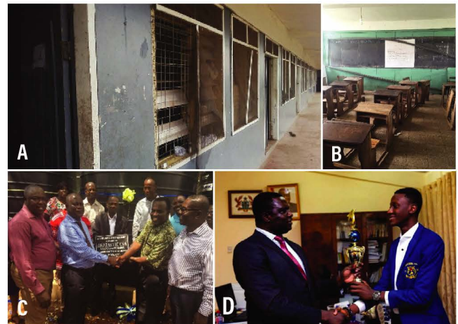
A: Dormitory B: Classroom C: Sword cutting for $33K OWASS Water Project D: 2017 Robotic Championship Trophy for OWASS

The Fund was motivated by the crumbling and decaying infrastructure and facilities, degrading landscape, the urgent need to expand capacity for the increased enrollment and the limited financial resources available for these purposes. The facilities and infrastructure that catered for 850 students in the 1970s and 1980s now cater for over 4,000 students with minimal capacity expansion. The displayed photos show the decaying OWASS infrastructure and facilities, a new water project and the 2017 OWASS Robotic Championship Trophy. The School needs to urgently fund periodic maintenance, upgrades, and expansions in classrooms, science laboratories, dormitories, recreational facilities, and library resources to sustain environments for quality education. Since 1952 and the subsequent years during which the original infrastructure and facilities were built, there have been limited maintenance, upgrades, and renovations due to lack of funding. The Fund aims to provide income for such periodic maintenance, upgrades, expansions, and major overhauls in perpetuity.